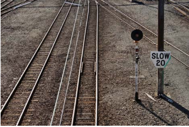
Linda Strand – Wellington Railway Station