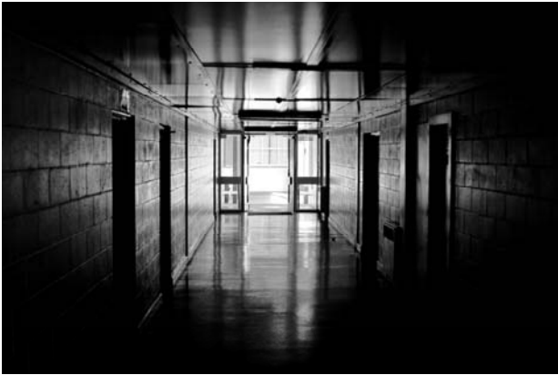
Duncan Babbage – Monochrome