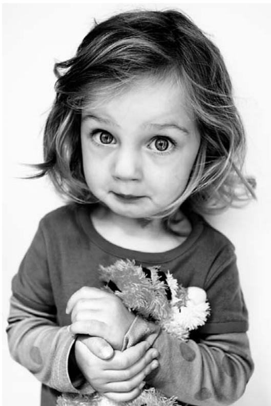
Eva and Tiggy by Catherine Cattanaach

We need as many members as possible to go along and cheer loudly for our entries and heckle the judge when he/she doesn't see that our print is the best.