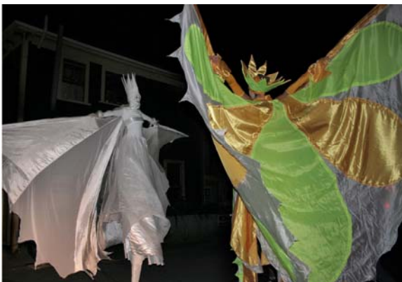
Cuba festival parade by Mike Drain

More details are available on the PSNZ website at: http://www.photography.org.nz/ray_barlin.htm