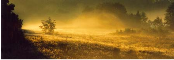
Early morning, Latvia by Liga Rodgers