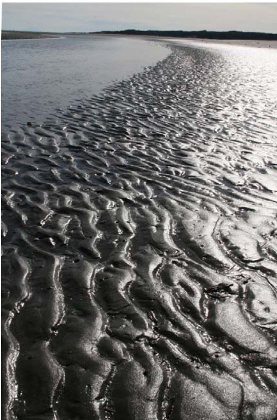
Gleaming sands by Hilary Troup

An in-depth survey of the work of one of Australia's leading and most innovative artists. It features photography, sculpture, installation and video works from the 1970s to the present, all characterised by the inventiveness and curiosity that typify Hall's work. Born in Sydney and based in Adelaide, Hall began her career in photography and later extended into sculpture, installation, garden design and video. Her work uses ordinary materials and objects which are transformed into complex and allusive art works, often through highly labour-intensive processes.