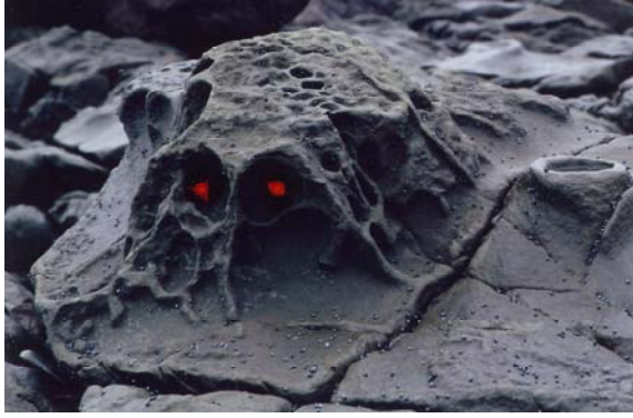
Me in a good mood by Syd Moore