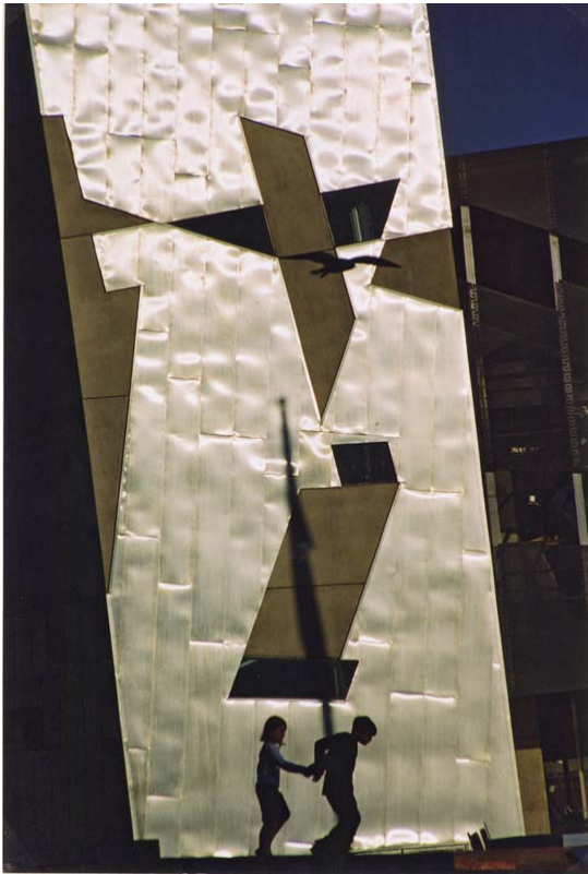
Melbourne by Duncan Bennett

Approximately 150 images were submitted for selection by 22 members. Thanks to all who submitted; your support is appreciated.