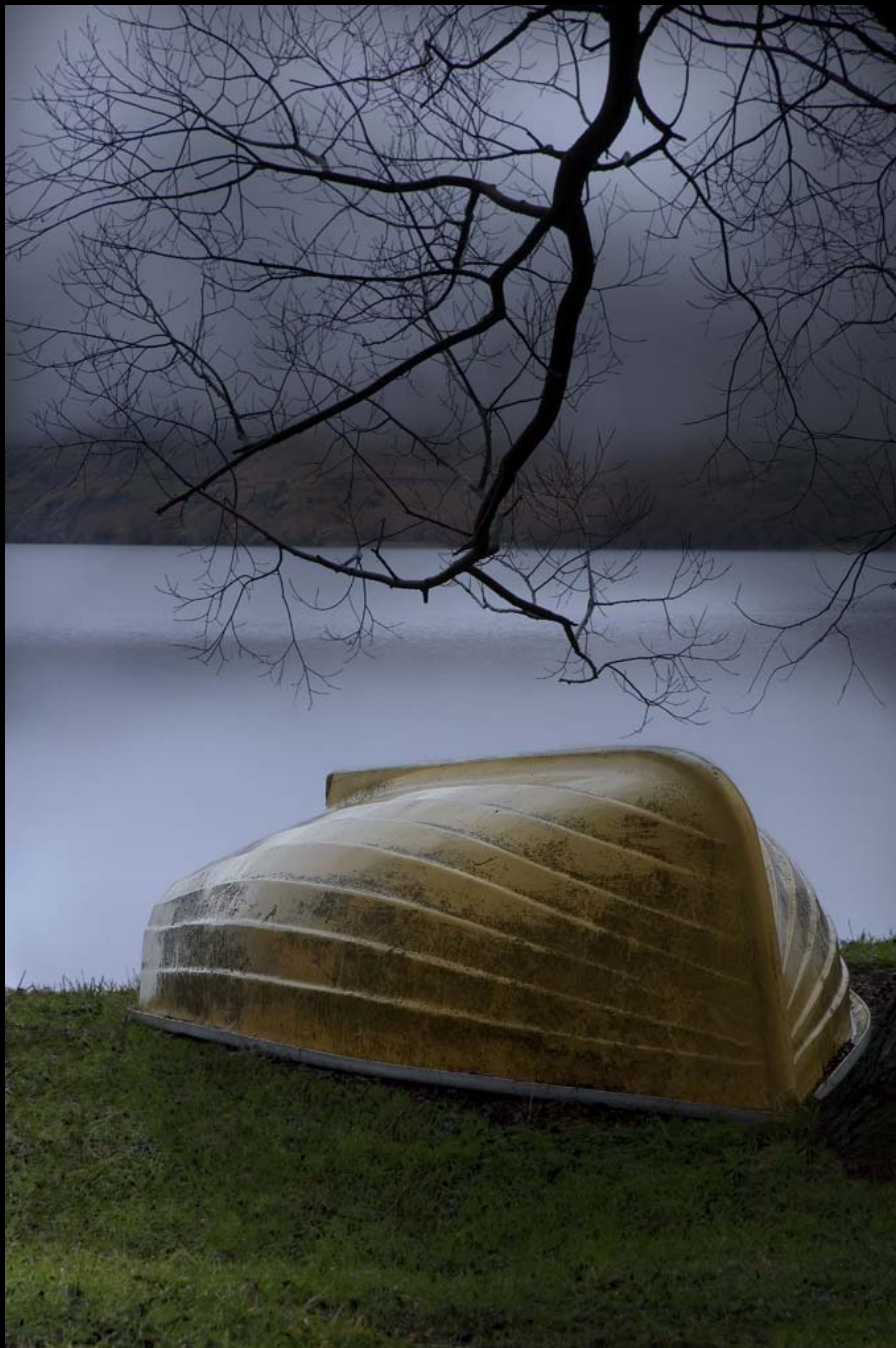
Cover image: Early morning by the lake by Jenaro Garita