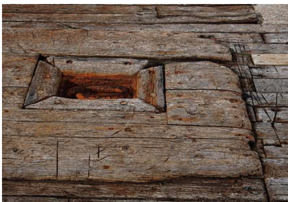
Old boat hatch cover by Mike Drain

Congratulations to all the above members.