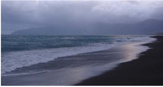
"Lake Ferry sands" by Hilary Troup (from the exhibition)