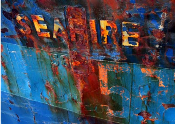
'Seafire' by Mike Drain (WPS entry in "Weathered" section of Interclub Battle)