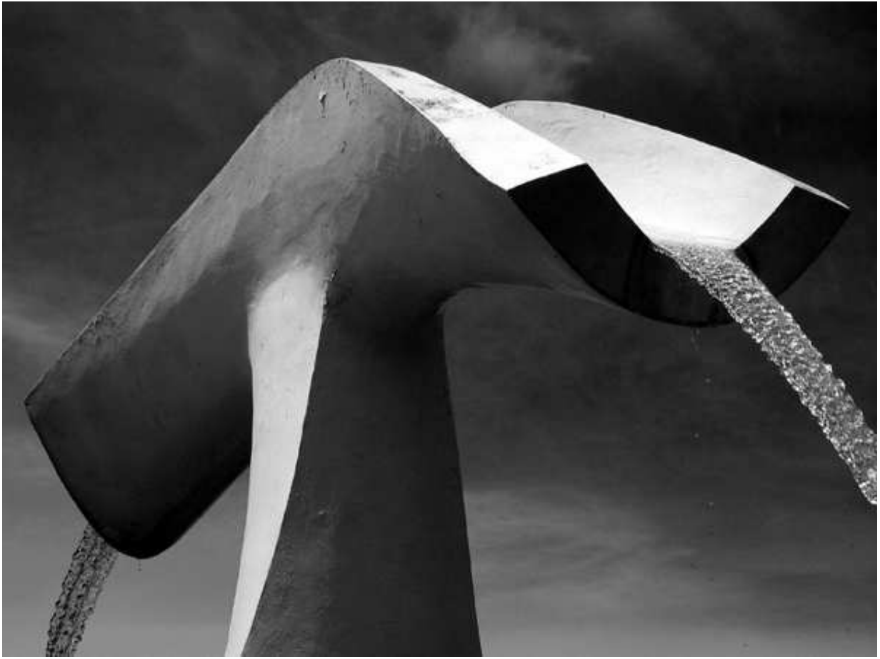
'Untitled 4' by Peter Sunderstorm