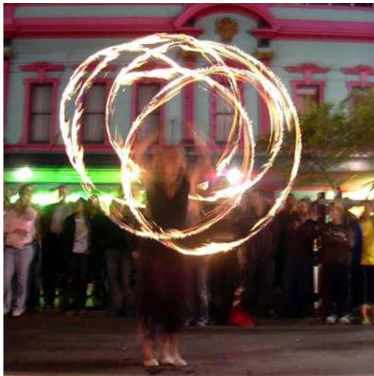
'Carnival Fire' by Nuala Fitzpatrick

And finally, thanks to all those highly constructive armchair critics who turned up on the night!