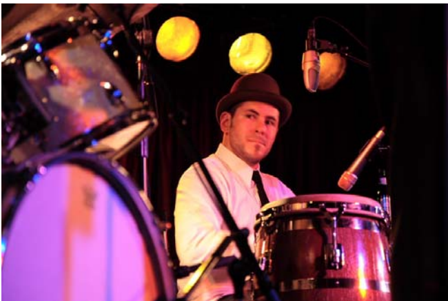
2006 Wellington Jazz Festival