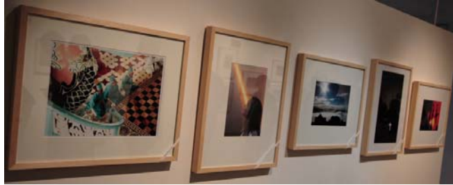
WPS Annual Exhibition - Images by Peter Hunt