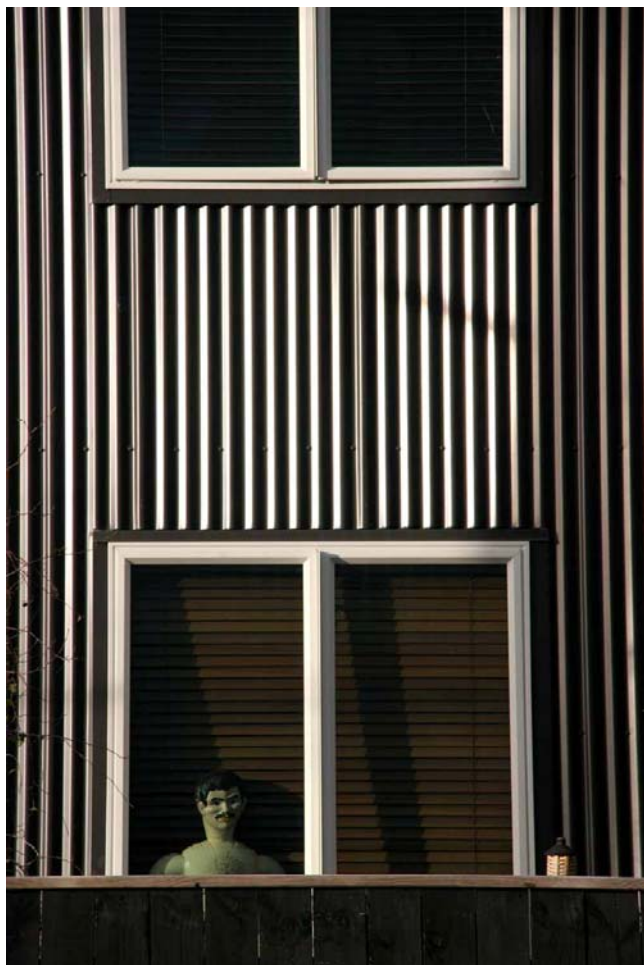
Berhampore Boy by Jenny Dey

WPS have not entered these PSNZ organized competitions for several years, but are planning to enter a set of 4 landscape prints and a set of 4 landscape slides for these Interclub competitions in 2007.