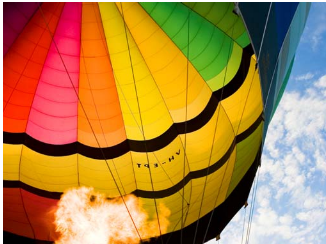
'Up and Away' (Mildura) by Ross Collins Honourable mention in the OPEN category 2007 WPS Projected Image Competition