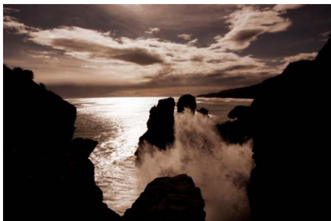
Image by Simon Woolf 3rd place in the Reflections category 2007 WPS Projected Image Competition