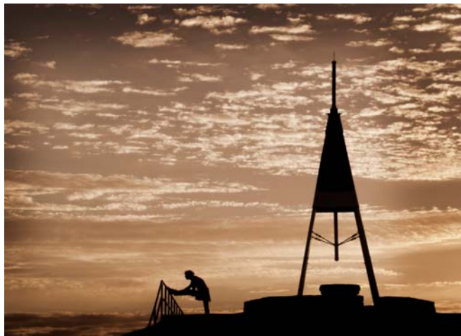
'Early Morning Jogger' by Simon Woolf Honourable mention in the OPEN category 2007 WPS Projected Image Competition