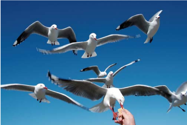
Image of seagulls feeding 2nd place in the OPEN category 2007 WPS Projected Image Competition