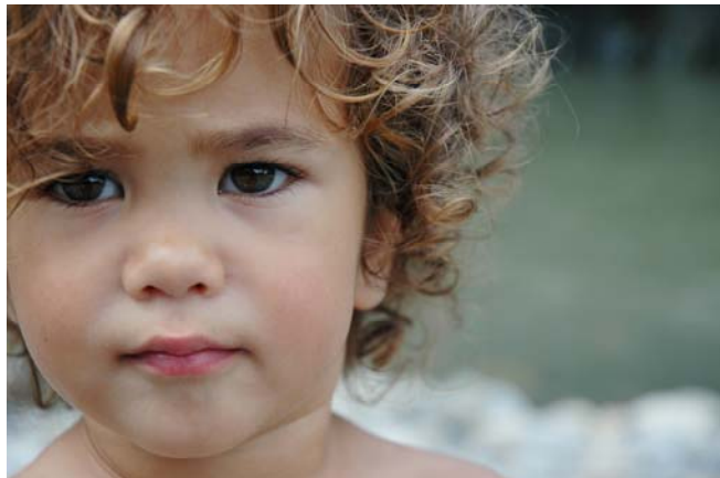
'Mairehau' by Hinimoa Grace Honourable mention in the OPEN category 2007 WPS Projected Image Competition