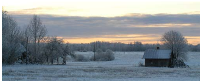
'Winter Landscape' (near Dunva, Latvia) by Liga Rodgers Honourable mention in the OPEN category 2007 WPS Projected Image Competition

Each section will be assessed separately, with a Champion Trophy (which the winner keeps) awarded to the top image in each section, along with Silver and Bronze Medals, and Honours and Acceptance Certificates. Entrants may submit images in one section only, or in both.